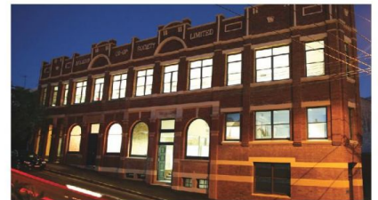
28 Montague Street, Balmain